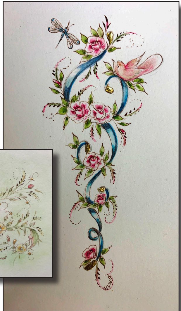
Heather's examples completed in class.

pointed pen birds, flowers, butterflies, dragonflies, and more.