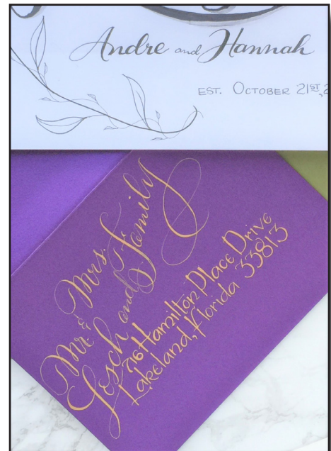
Below: Chris's unique pointed pen.