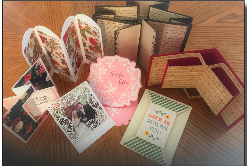
Cards made by Beth: Back: Screen Fold Card, Double Tri-Shutter Card. Front: Swing Card, Picture Frame Easel Card, Shaped Easel Card, Double Point Fold Card.

It will be a busy day making unique one-of-a-kind cards!