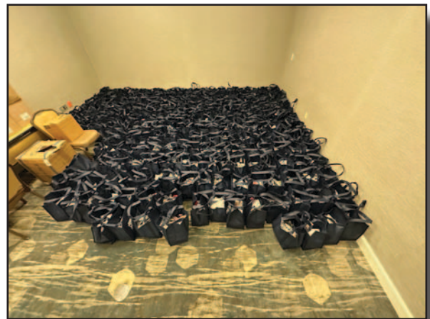
Goody Bags Galore!