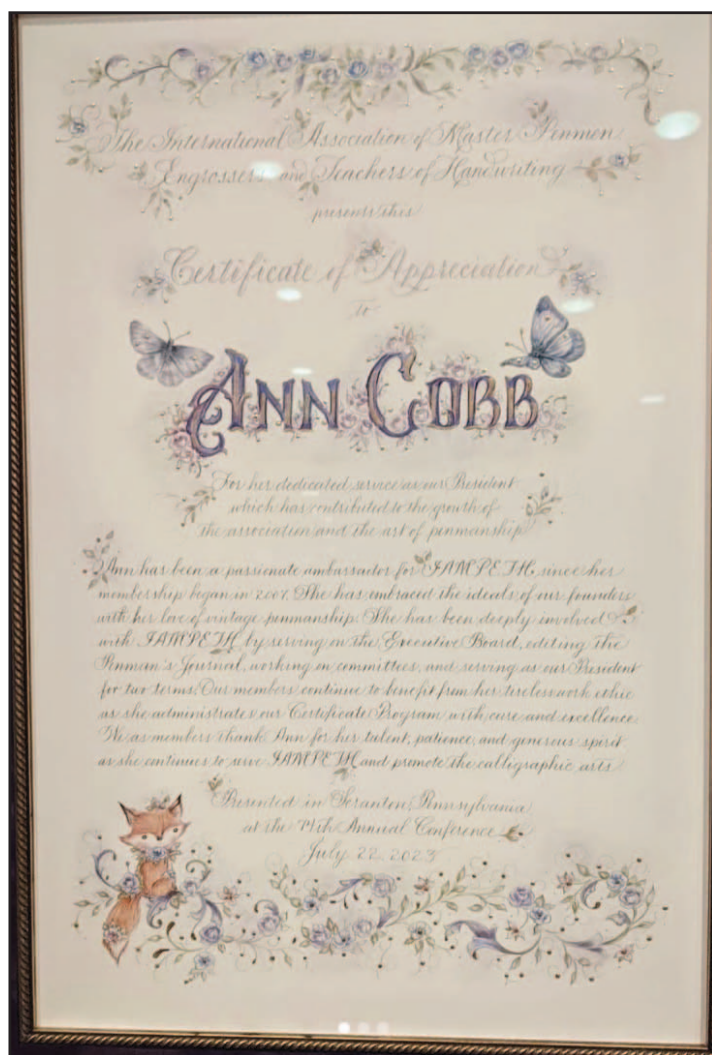
A photo of Ann's certificate