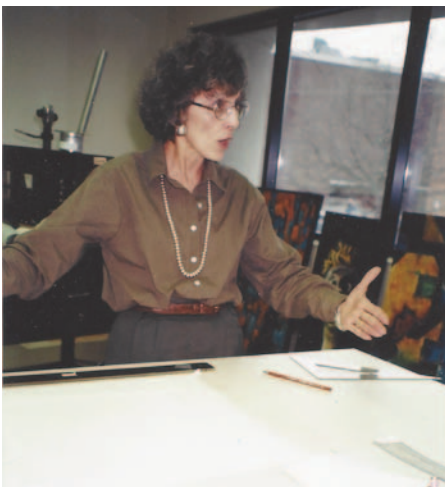
Striving for excellence!