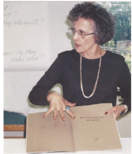
Teaching Humanist letterform