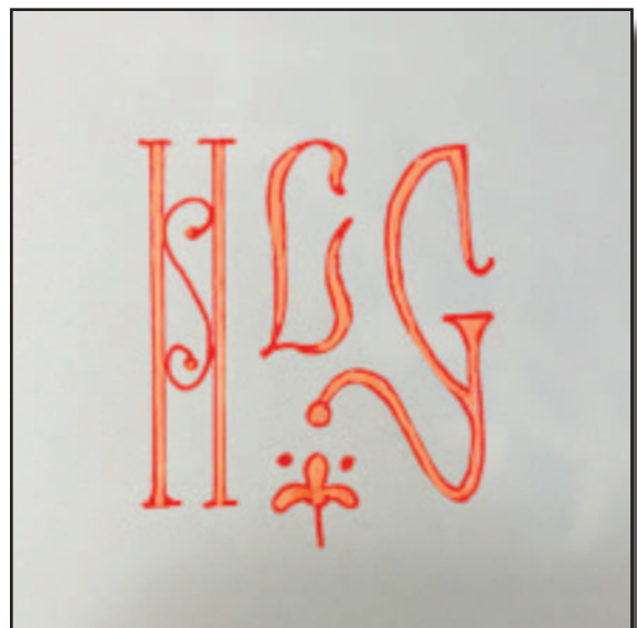
Art by GinnyPennekamp