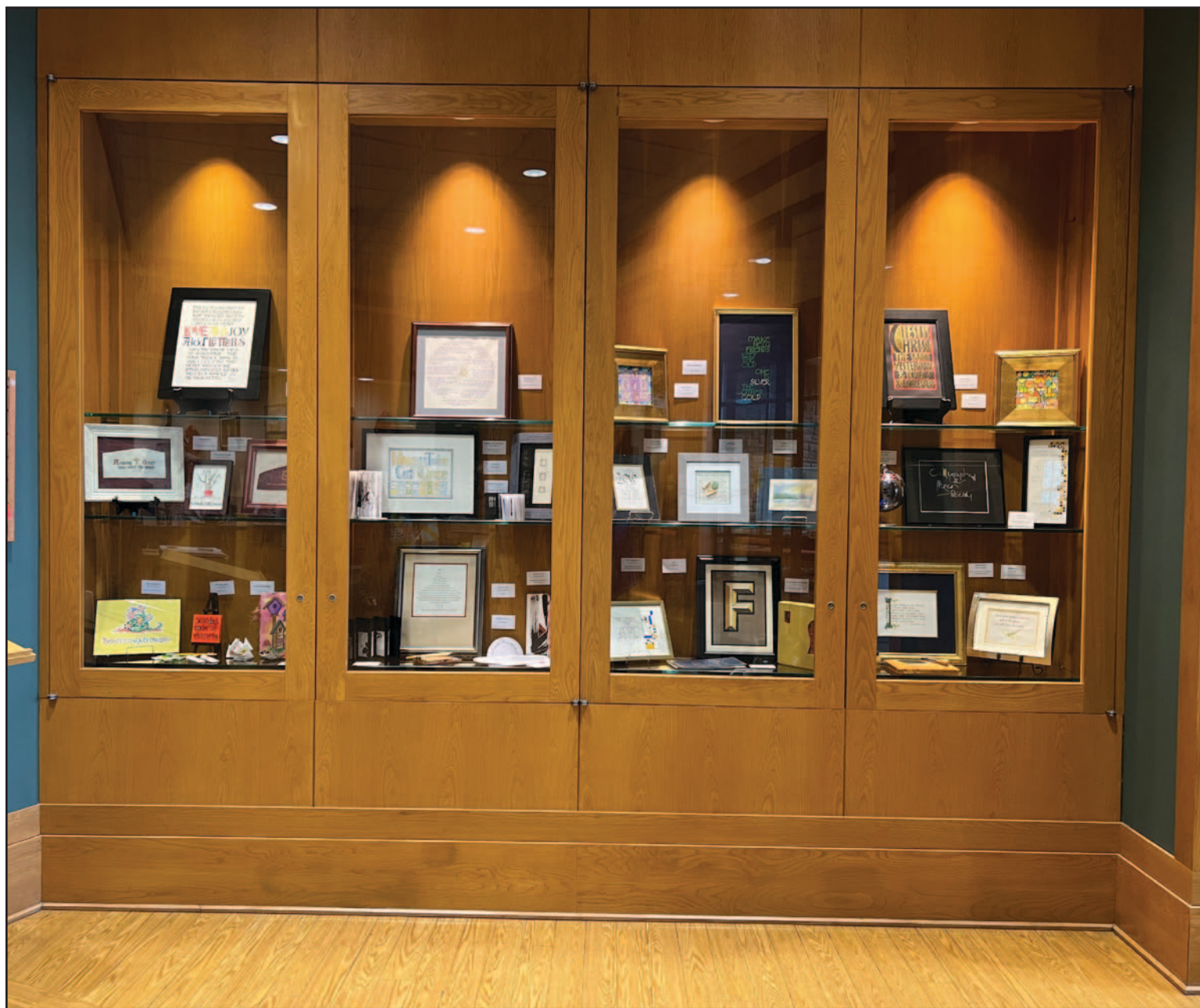
Calligraphy pieces in the case at the Library.