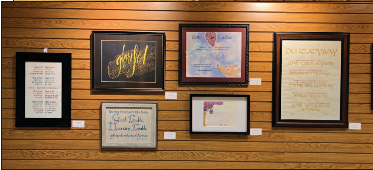
Larger calligraphy pieces on the wall.