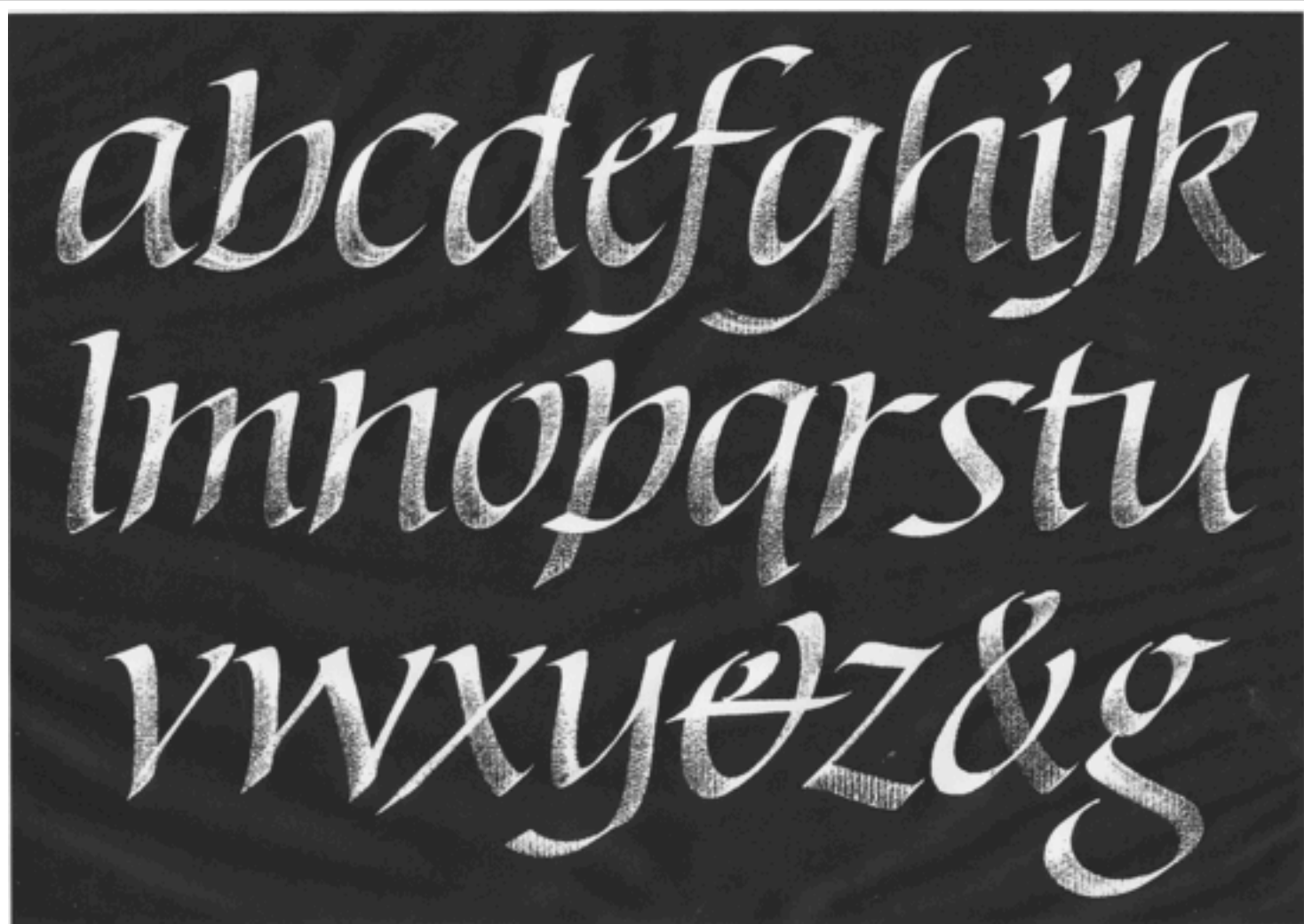
Carl Rohrs flat brush calligraphy, white gouache on black Ingres paper.